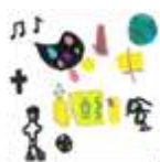
Inspirational Curriculum Polly – Oysters Class