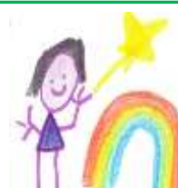
St Alphege Values Eli – Shells Class