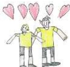
Amazing Relationships Eyobel – Puffins Class